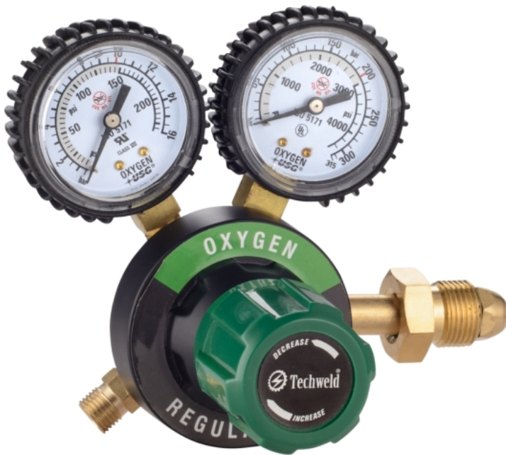
Part no - 30GE-REG-OXY-TRO002

Inlet pressure – Air @ 70 degree Fahrenheit